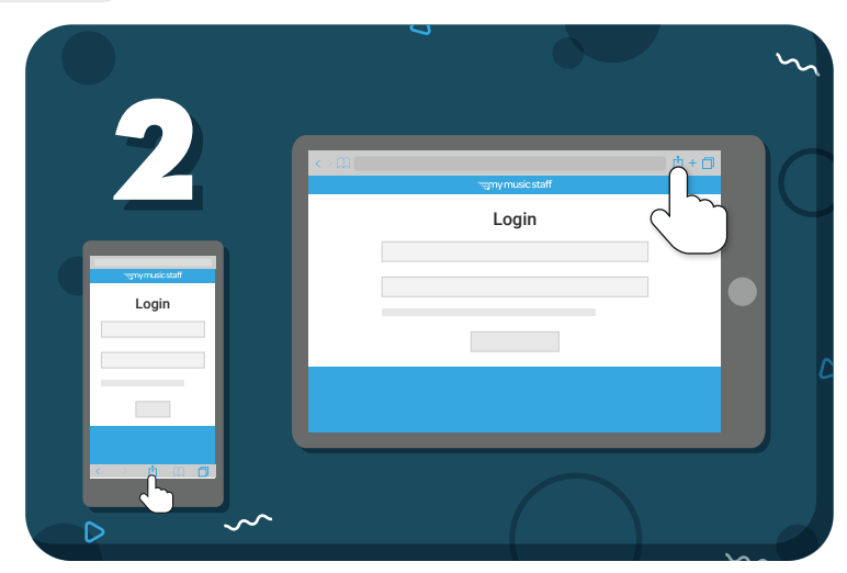
Log in to the Student Portal then tap the browser's Share icon