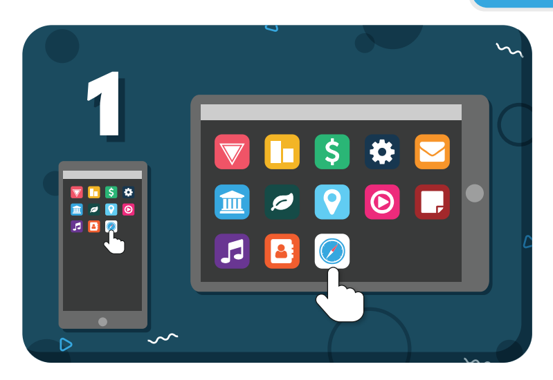
Open the Safari browser on your device